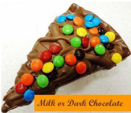
Milk or Dark Chocolate