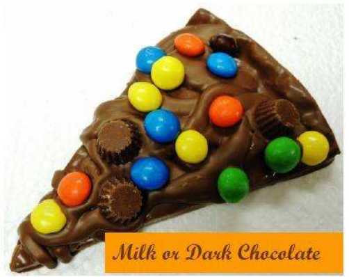
Milk or Dark Chocolate