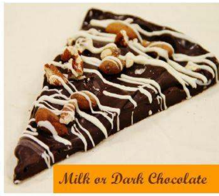
Milk or Dark Chocolate