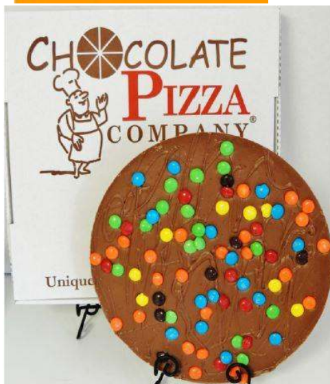
Milk or Dark Chocolate